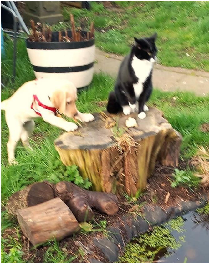
Figure 17. Dawn in the garden with the cat

Hi, my name Dawn and I have been described as a sweet, assertive, busy and very cuddly puppy. I'm a bit of a mix with mum being a labrador x golden retriever and dad being a golden retriever.