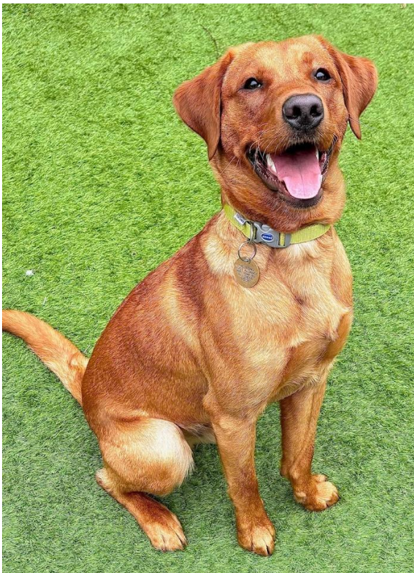
Figure 7. Smiling Glen

Since our last update at 6 months, Fox Red puppy Glen continues to grow into a young dog and now weighs in at a healthy 25.8 kg. Glen completed his Kennel Club Puppy Foundation level soon after our last update.