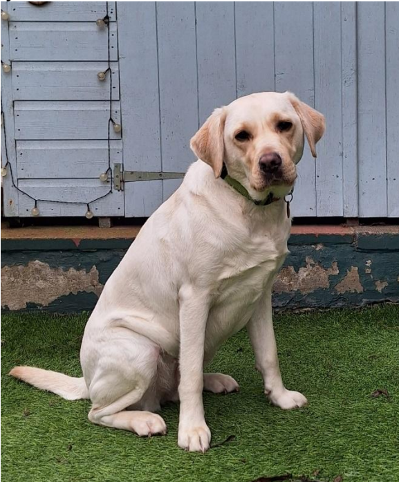
Figure 3. Sadie in a garden