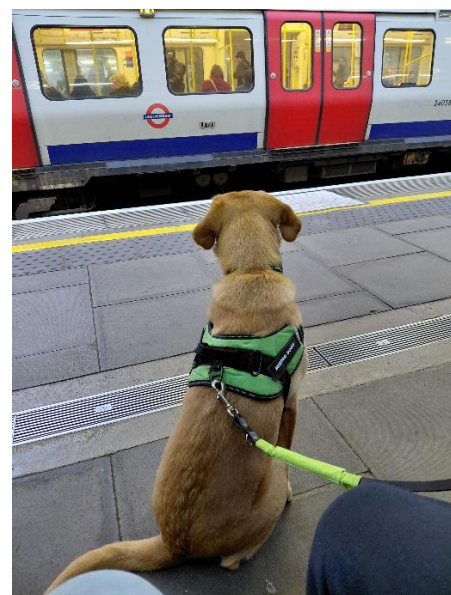
Figure 10. Bella waiting for the train

We are still receiving compliments on her good behaviour and we will definitely miss her when she moves to an instructor for Seeing Dog training.