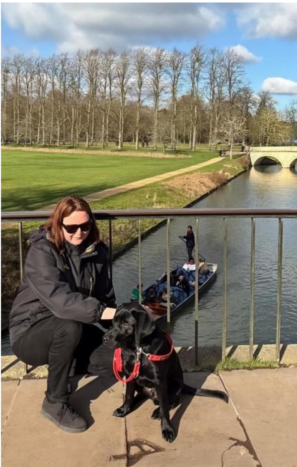
Figure 11. Paddy with his puppy walker on a trip to Cambridge

He is not happy at all when his outdoor space is clean and tidy, as he jumps around it (no harm done to the dog).