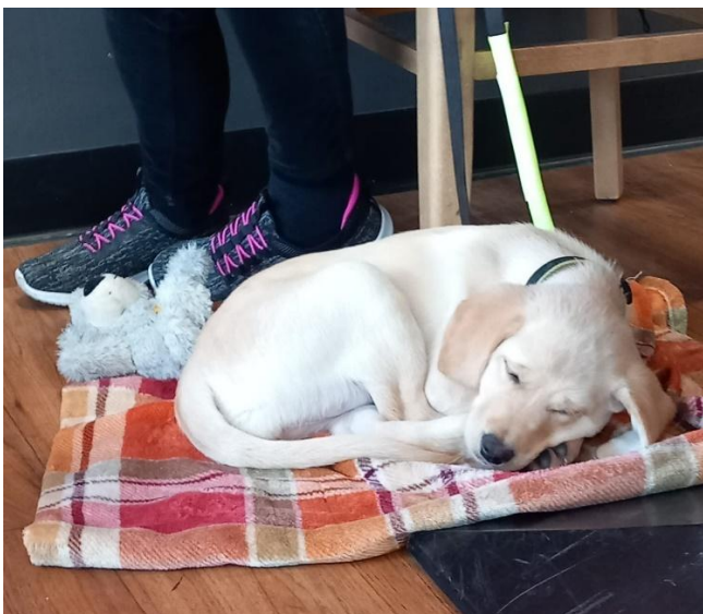
Figure 18. Dawn settled in the coffee shop.

At the moment, I am trying to get the hang of our routines and toilet training, but I'm hoping everything will fall into place soon and so do my puppy walkers! I've been spending time making friends with the resident cat called Jam, although, she is quite picky about the games we play. I know that because she regularly taps me on the nose if she isn't keen on the game.