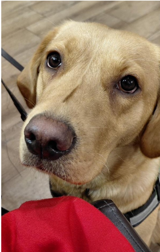
Figure 9. Bella looking at her Puppy Walker

Bella, a Red Fox lab, is now 9 months old and weighs 20kg. She has a gentle nature and has matured into a very responsive and calm dog.