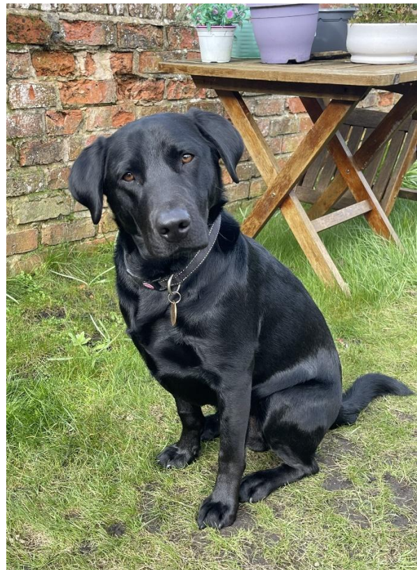
Figure 6. Harry in the garden