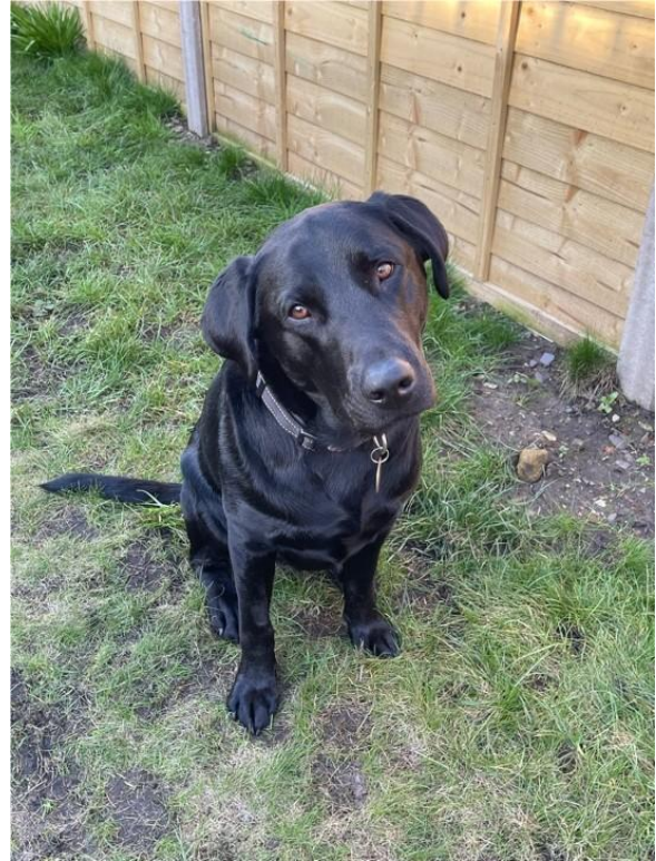
Figure 5. Harry in the garden

It's early days for Harry in the 'big boys club', so we will see how he progresses, once he has recovered from his recent neuter.