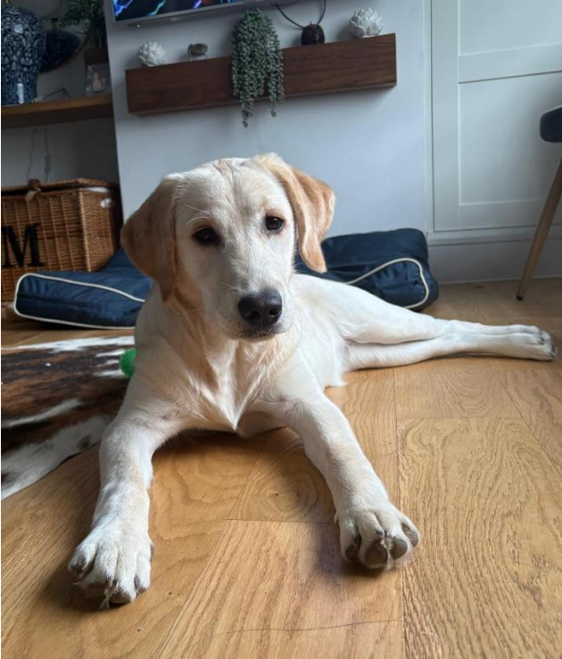
Figure 15. Dora relaxing