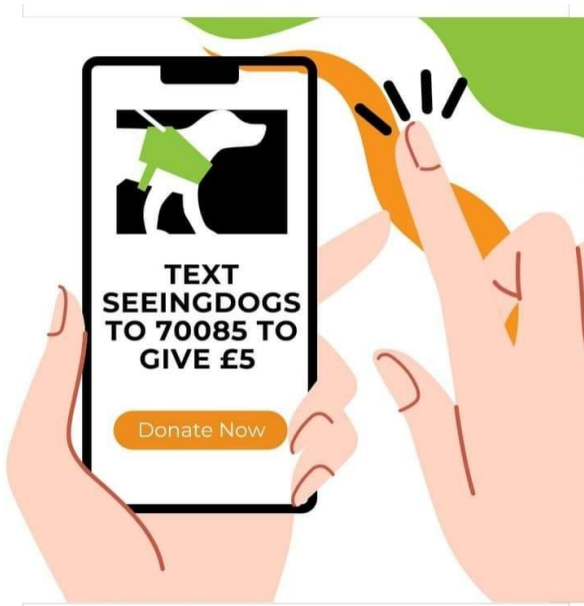
Figure 20. Number to text to give £5

It costs around £20,000 to fully train a Seeing Dog. With generous donations we can continue to provide visually impaired people with independence and mobility, that can be taken for granted. 100% of your donation goes to training Seeing Dogs.