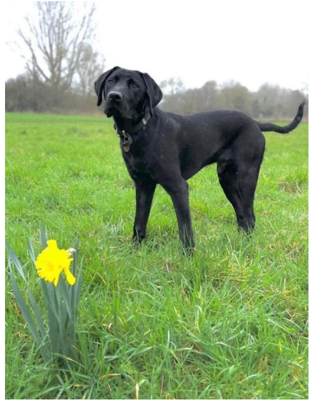
Figure 14. Jensen in a field

Black Labrador, Jensen will be seven months old in March and continues to be a very sweet natured puppy. He still loves his toys, plays happily on his own and is always keen for a game of tug.